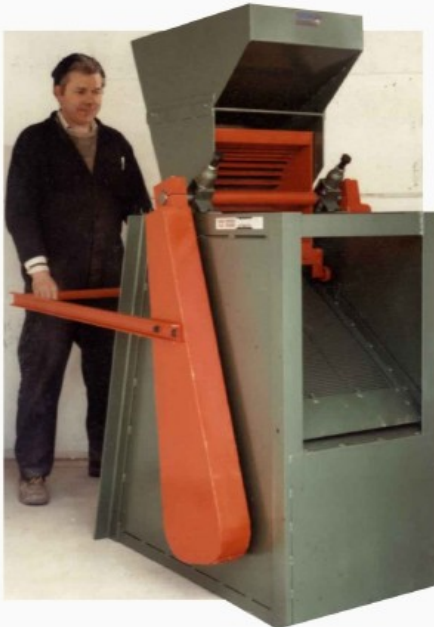
THE EARLIER DEVELOPED PENDULUM CLAY CRUSHER

Wheelbarrow collects the output from the crusher heads inside the machine.