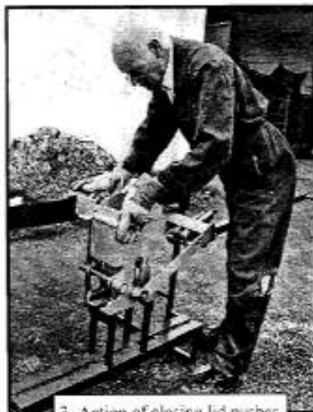
3. Action of closing lid pushes excess clay back on to table