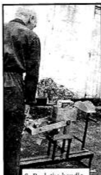
9. Push the handle down further to eject the brick