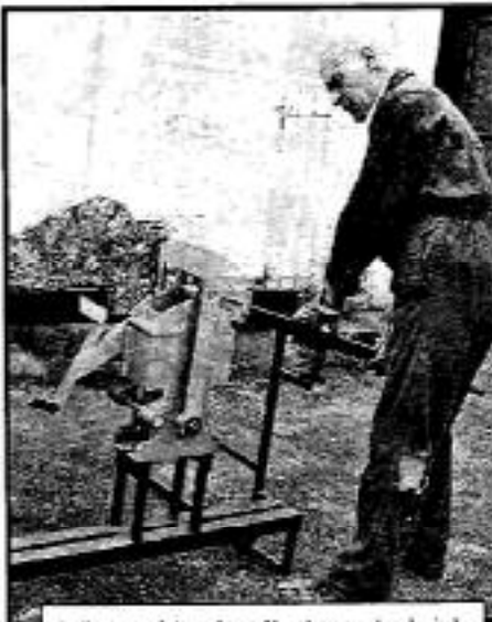
6. By pushing handle down the brick maker exerts several tones pressure on the clay in the box