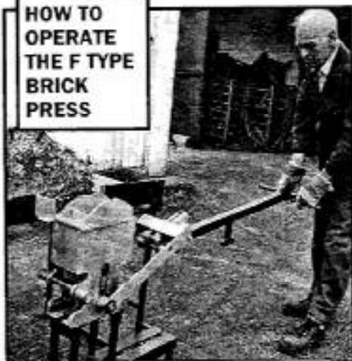
1. With the press box lid closed swing the handle to the press to the filling position