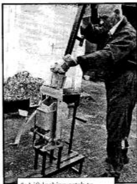
5. Lift locking catch to release for pressure stroke