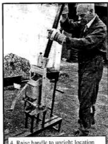
4. Raise handle to upright location ready to compress the press rollers will drop into place automatically