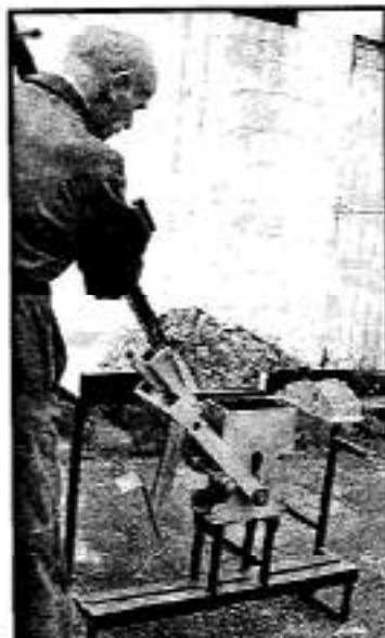
8. When handle moves clear box lid turn this clear of box