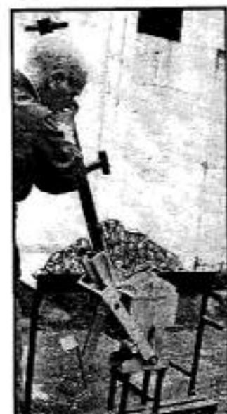
7. Swing handle upright again making sure that the locking catch engages fully