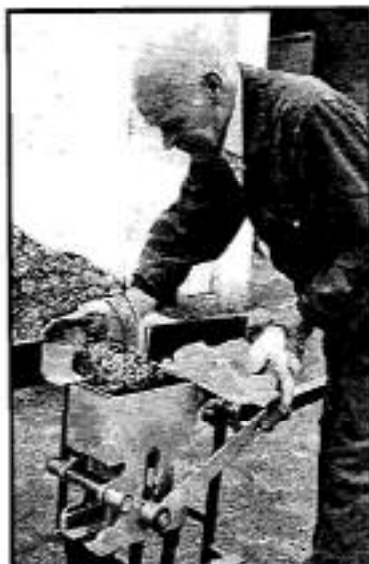
2. Open lid and push clay from the table into the press until filled to top