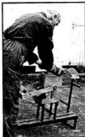
10. Take the brick away to restart the operation